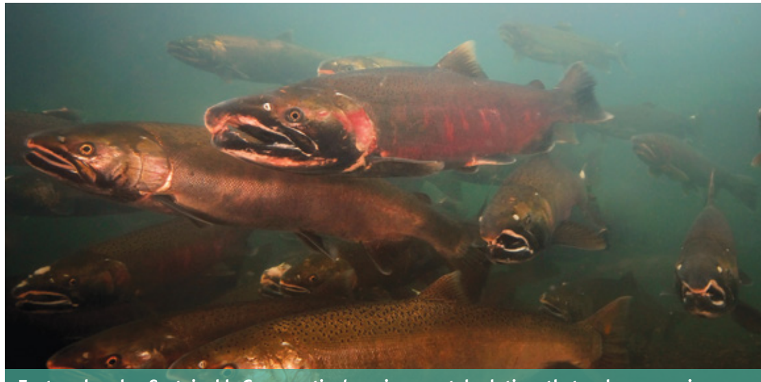
For two decades, Sustainable Conservation's environmental solutions that make economic sense have improved and protected the health of California's rivers and fish, including coho salmon.

2013 marked Sustainable Conservation's 20th anniversary, a time for reflecting upon what we have been able to accomplish through our unique approach to environmental problem solving. Thanks to your steadfast partnership and support, Sustainable Conservation is on track to pioneer the next big ideas in conservation.